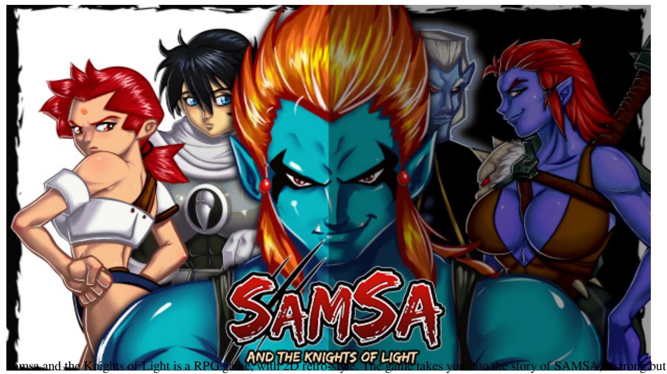
lazy demon who wants to save the world, his way. While going against a society that judges him for every action, SAMSA can show that you shouldn't judge a book for it's cover.

SAMSA is the main character in the story, and his name means "Shadow", the place from where he was saved. In the game you will find DIFFERENT CHARACTERS, every one of them with their own abilities and personality.